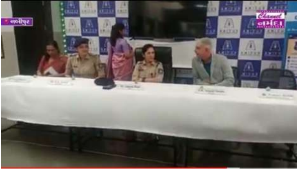
E-FIR Awareness Programme @AISB in Channel Narmada Samachar dated 27 th July, 2022

(Click the link & watch the video clip from 16.35 minutes)