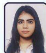
TAMAN BHATIA 87.00 %