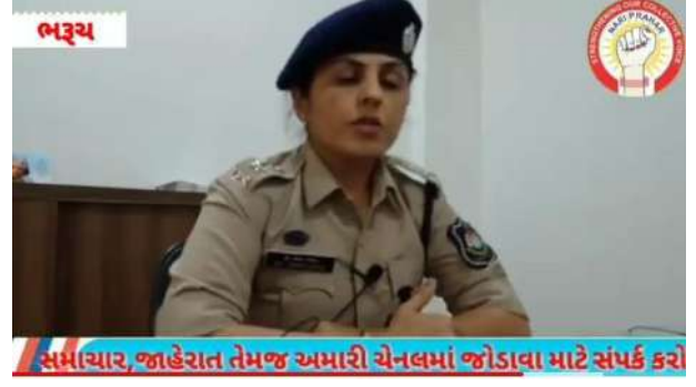
E-FIR Awareness Programme @AISB in Nari Prahar News dated 27 th July, 2022

(Click the link & watch the video clip from 16.35 minutes)