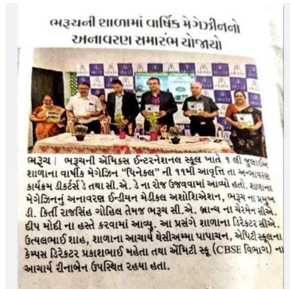
'Unveiling Ceremony of PINNACLE- Annual Magazine of the School' Published in Divya Bhaskar dated 2 nd July, 2022