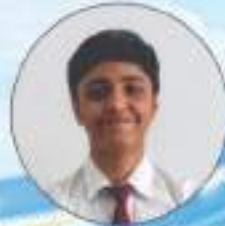
DEV CONTRACTOR 91.0 %