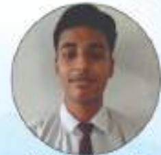
ATHARV MATTE 95.4 %