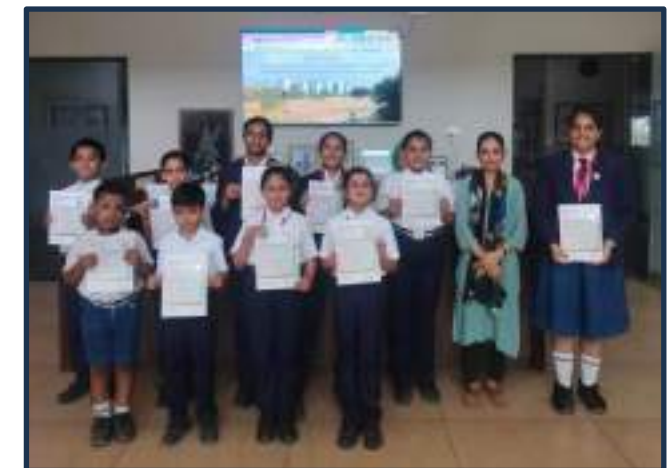
Certificates and medals awarded to the students who have cleared the spellbee level - 3 and have qualified for level - 4 examination