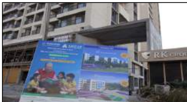
R.K. Celestial, Tavra Road.

We are delighted to announce that Amicus International School will soon be launching its new Pre-Primary Branch, Ruskin Bond International School marking a significant step forward in nurturing young minds.