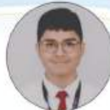
NAITIK 97.6 %