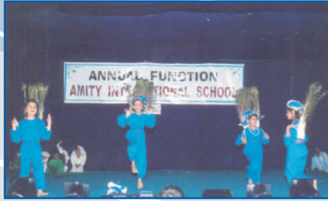
Colour, grace and beauty – all fused together for peacock dance.