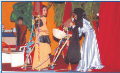
Highly captivating scene from 'Snow white and the seven dwarfs' staged on Melange 3.