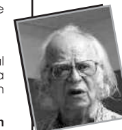
Prof. Yashpal Sharma

Adequate time, staff, accommodation and its maintenance, funds, pedagogical equipment, playgrounds are essential pre-requisites for effective curriculum transaction but unfortunately, an overwhelming majority of schools do not have even the minimum essential facilities. The method of teaching used in majority of teachers are devoid of any type of challenge for the students. Children are hardly provided all opportunity to observe and explore natural phenomenon. The concept of library as a readily available source for learning simply does not exist in most schools. Similarly, science laboratories are not equally equipped and are not used for experimentation and discovery.