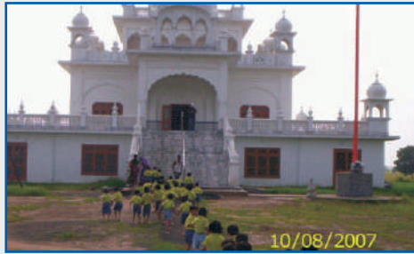
Inculcating the spirit of religious tolerance.