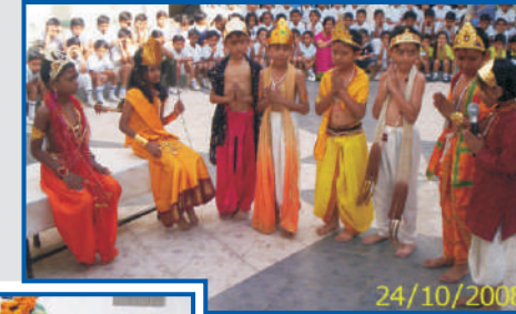
A skit showing the triumph of good over evil on Diwali.