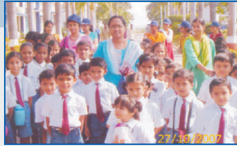
Field Trip to Pepsico