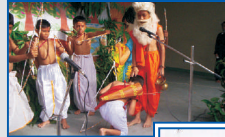
Skit highlighting the importance of selfless service rendered by Guru.