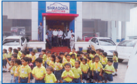
Young Automobile Engineers at Shradha Motors