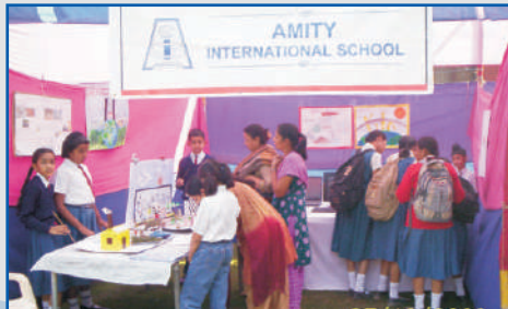
An exhibition of innovative ideas.