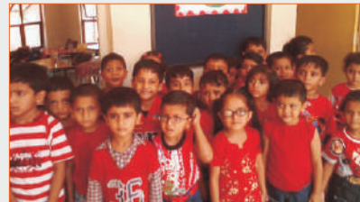
Little cherubs shining bright in red.