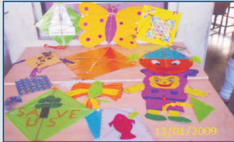
Spirits soared high while participating in kite making competition.