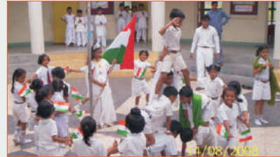
Safe is the future of the nation in the hands of young patriots.