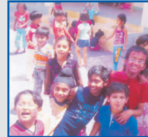
Colourful extravaganza on Holi