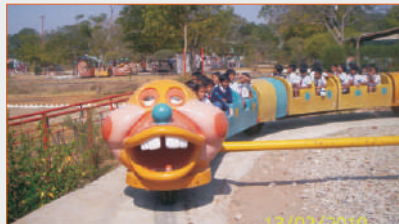
Having a gala time on the joy rides at Ajwa.