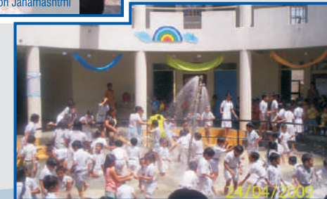
Appeasing the rain god with monsoon splash.