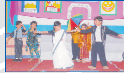
A splendid dance performance displaying Shringar Ras