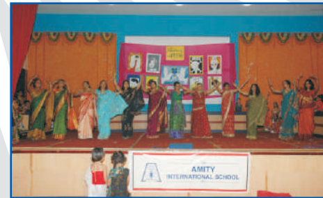
Teacher's dance joyfully adding to the fun and frolic