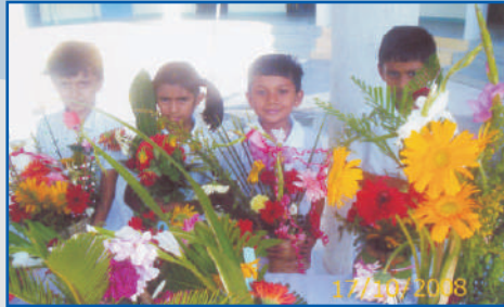
The floral blooms of Amity International