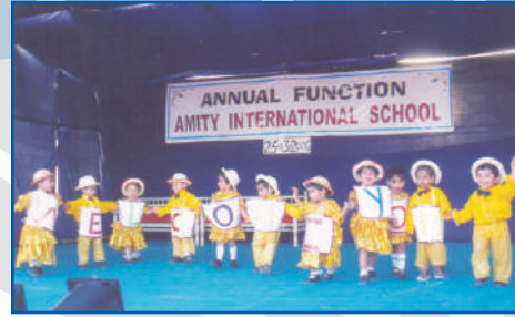
The tiny tots welcoming the guest