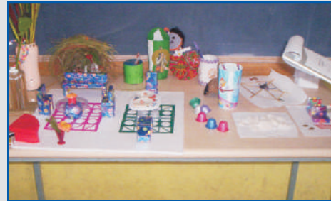
Creating an immense wealth out of waste