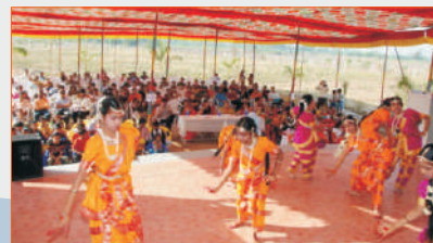
Captivating dance performance on Open BharuchTalent Hunt