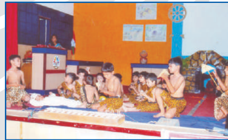
Students enacting the evolution of mankind