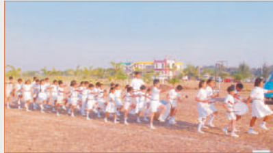
Marching ahead on Annual Sports Day.