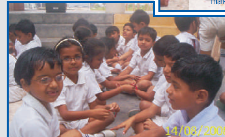
Symbolic bond of love and trust