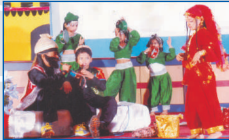
Merzina alluring the forty thieves with her Arabic dance in the play Ali Baba and the Forty thieves.