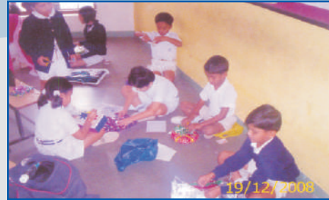
Spirits soared high while participating in kite making competition