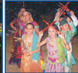
Students revelling in the ecstasy of festivity during Navratri celebrations