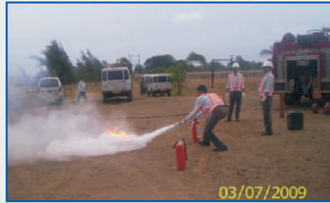
Displaying the fire fighting techniques.