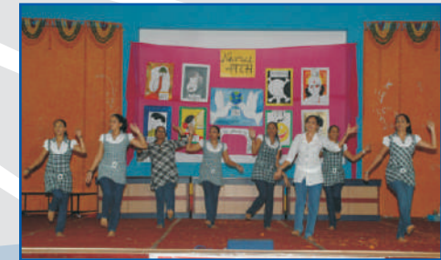
Mothers adding glitter to Melange 5 with their foot tapping number