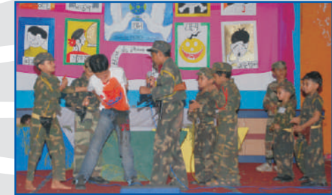
Spectrum of human feelings on the canvas of life.