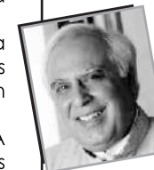
Mr. Kapil Sibal

We are going to bring a law to prevent, prohibit and punish educational malpractices in the country. It is meant to make the system more transparent," he said. Anyone breaching the law should be punished, he added.