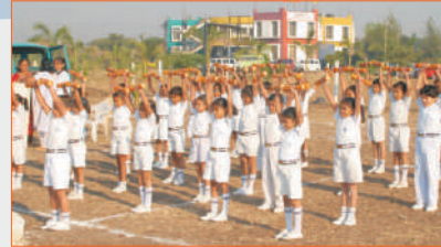
Mass P. T. and drill in progress