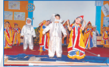
Fusion of Kathputli and Robot dance depicting the theme Then and Now.