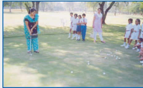
Learning the Skills of playing Golf.