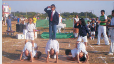
Marvellous display of stamina, grit and determinations.