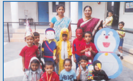
Children adorned in fancy clothes impressed the audience.