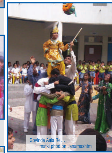
Govinda Aala Re... matki phod on Janamashmtmi