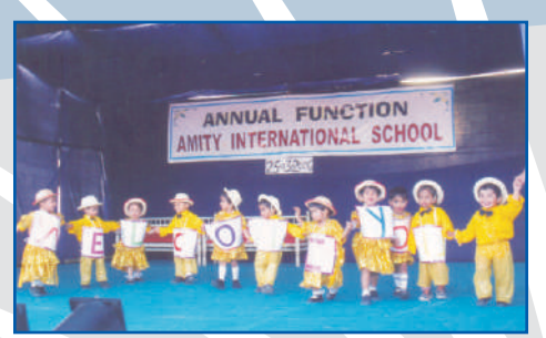
The tiny tots welcoming the guest