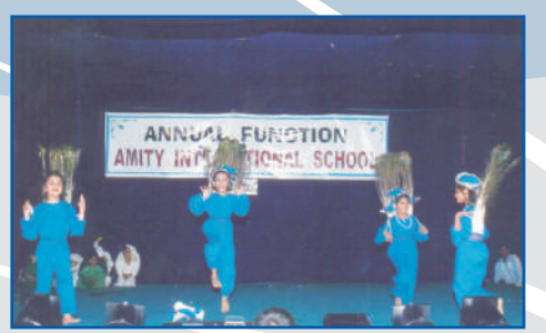
Colour, grace and beauty – all fused together for peacock dance.