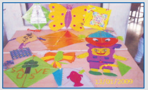
Spirits soared high while participating in kite making competition.