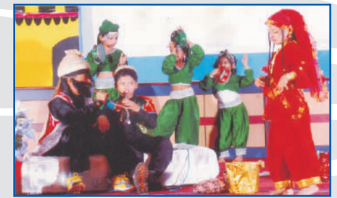
Merzina alluring the forty thieves with her Arabic dance in the play Ali Baba and the Forty thieves.