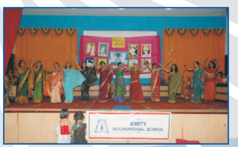
Teacher's dance joyfully adding to the fun and frolic