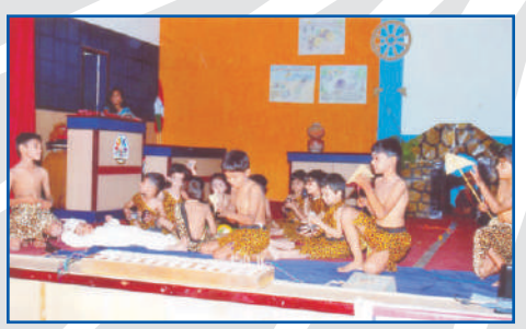
Students enacting the evolution of mankind