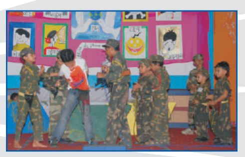
Spectrum of human feelings on the canvas of life.