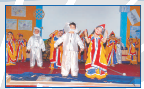
Fusion of Kathputli and Robot dance depicting the theme Then and Now.