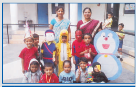
Children adorned in fancy clothes impressed the audience.