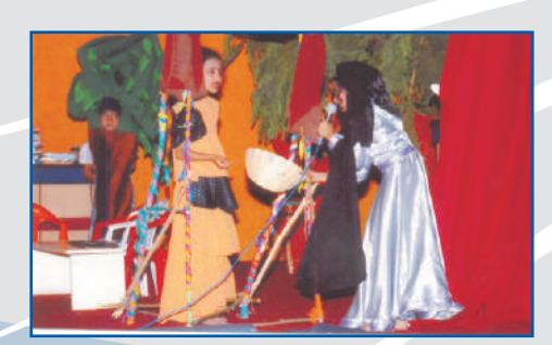
Highly captivating scene from 'Snow white and the seven dwarfs' staged on Melange 3.