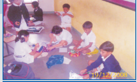
Spirits soared high while participating in kite making competition