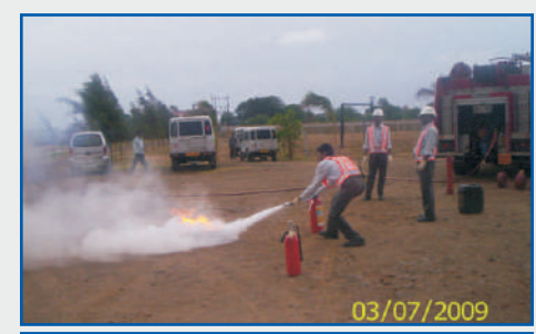
Displaying the fire fighting techniques.